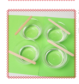
3. Pour liquid soap into four flexible plastic containers.

2. Cut \frac{1}{3} of the block of soap into several small cubes and place in a measuring cup. Heat in the microwave for about 1 minute, or until liquid.