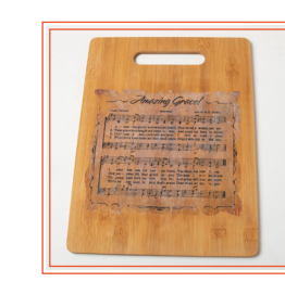
7. Rub off any remaining white paper with a wet finger. Let it dry.