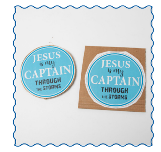
4. Glue the two circles onto cardboard and cut them out. Glue twine around the edges to cover the cardboard.