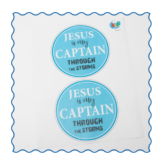
3. Print out the attached page of circles using a color printer, or make two 5" circles with the words: "Jesus is my Captain through the storms".