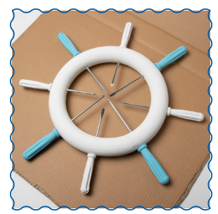
2. Divide the floral ring into 8 equal parts. Insert a screwdriver into the foam at each point, alternating the colors. Push in until the tips meet in the center. Lightly secure the screwdriver to the ring with hot glue.