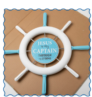
5. Glue the circles to the middle of the ring, one on each side.