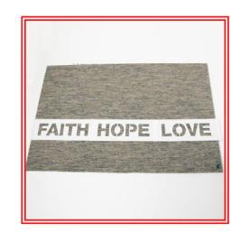
2. Cut out the rectangles containing the words "FAITH", "HOPE", and "LOVE". Using manicure scissors, carefully cut out the letters to make a stencil. Line up the three stencils 9-10" below the top edge of the mat.