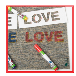
5. Hold the stencil for the word " LOVE " and color the letters red.