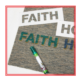
3. While holding the stencil in place, color in the word " FAITH " with green fabric marker.