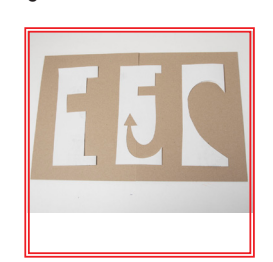
7. Fold these rectangles in half. Draw half of a cross on one, half an anchor on another, and half a heart on the third one. Cut them out.