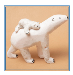
9. Draw eyes, nose, ears and claws on the polar bear and cub with a marker. Mama bear and her cub are ready to follow the path where they can thrive. Let's follow the path God has for us so we can thrive too!