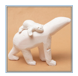
8. Paint the polar bear and cub white. Let it dry. If necessary, add 2-3 more coats of paint.