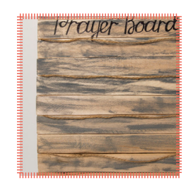
7. Repeat with the other three pieces of twine, skipping every other board.