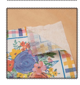
4. Separate the patterned top layer of the napkin from the white layer.